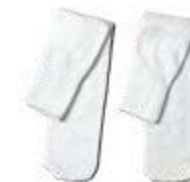
Color: White or off White