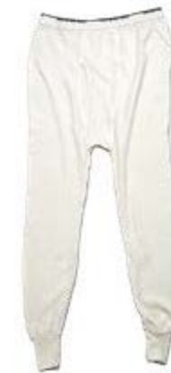
Color: White or Natural