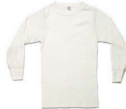
Color: White or Natural