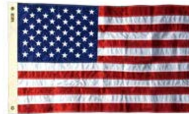
United States Flag